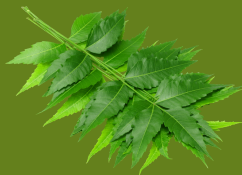
Neem Extract Powder