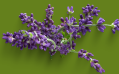
Lavender Essential Oil